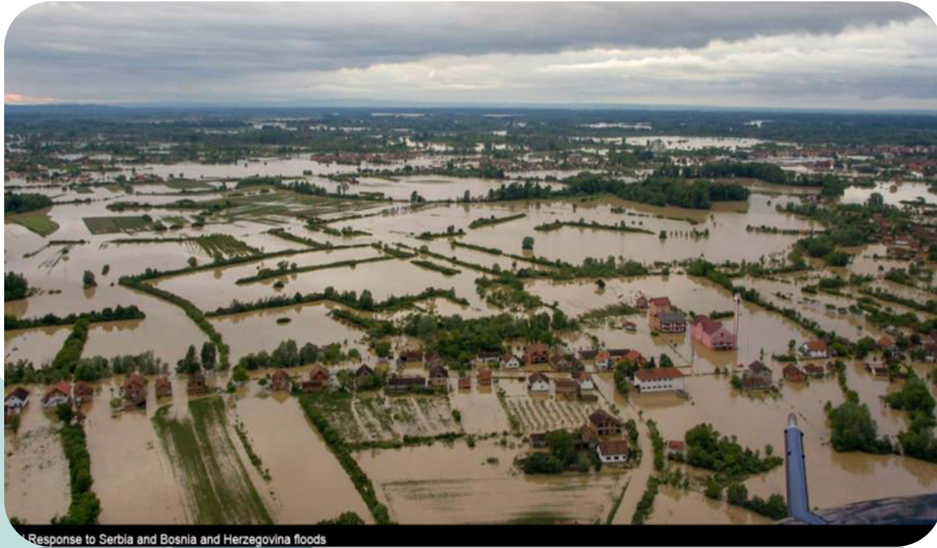
Response to Serbia and Bosnia and Herzegovina floods