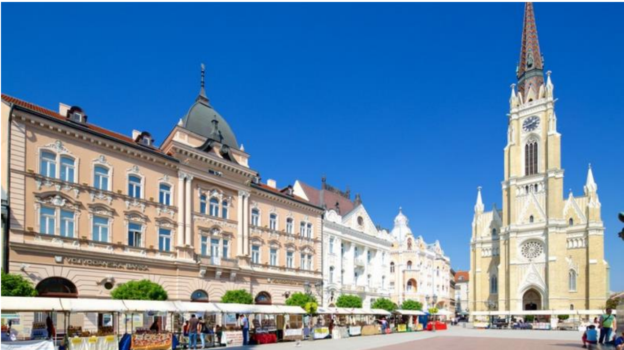
Novi Sad city center

Novi Sad in 2019 has the title of The European Youth capital, and in the year of 2021 it will be The European Capital of Culture , sharing the title with Eleusis (Greece) and Timisoara (Romania), so we are certain that the delegates will be able to enjoy the events while they are here.