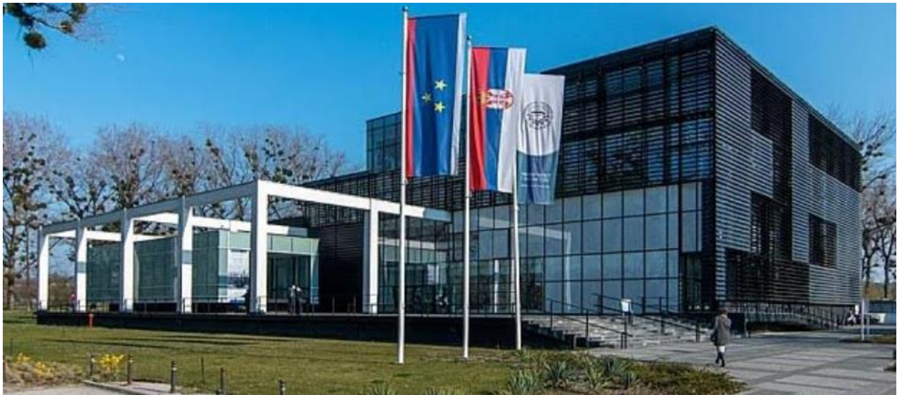
Rectorate Building, University of Novi Sad

The campus of Novi Sad University is unique in Serbia, since all the faculties are at the same location, so it is easy to organize big events and host with no problem a few hundred people, both in the main Rectorate building and FTS's premises.