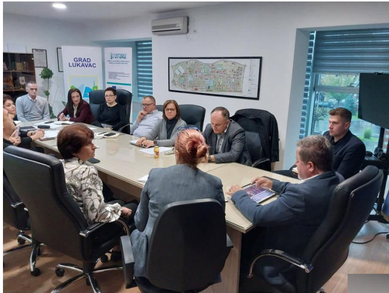
City Administration – Lukavac (meeting on 15th Nov in Lukavac)