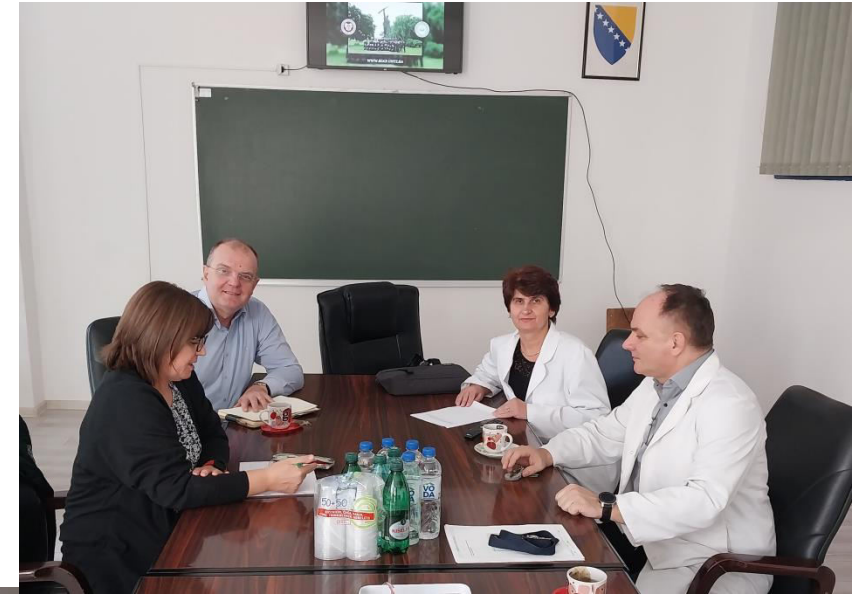
Chamber of Economy of the Federation of Bosnia and Herzegovina (meeting on 8th Nov in Tuzla)