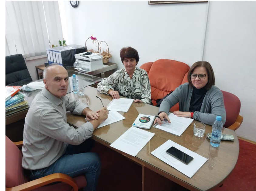
15th Nov meeting with Public Health Institution Lukavac administration